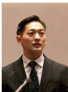
東京国際大学 大学院