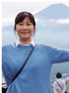
東京外国語大学 大学院