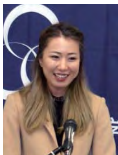
ファッションデザイナー