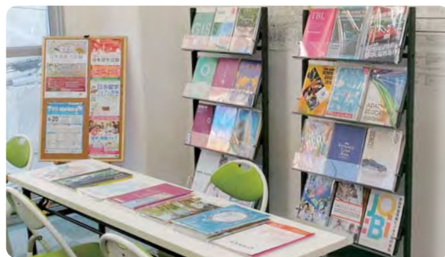
Materials for higher admission