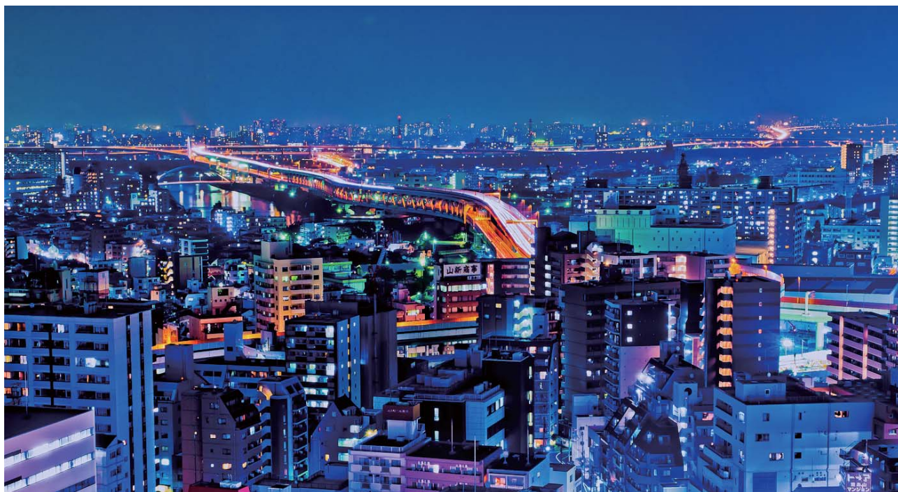
The night view of Tokyo Oji.